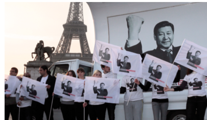
Posters of "Predator of Press Freedom" Xi Jinping making a rude gesture are paraded around Paris during the Chinese president's visit to Paris in April 2014.

When Chinese leaders have visited France – Hu Jintao in 2010 and Xi Jinping in 2014 – we have staged street protests in Paris to challenge their repressive policies. Now, with journalist Gao Yu , Nobel peace laureate Liu Xiaobo and blogger Ilham Tohti all languishing in prison, Tibet and Xinjiang cut off from the rest of the world and the Internet under close surveillance, the fight seems to be moving from the Chinese mainland to Hong Kong and to western democracies that rarely seem inclined to confront such an economically powerful country.