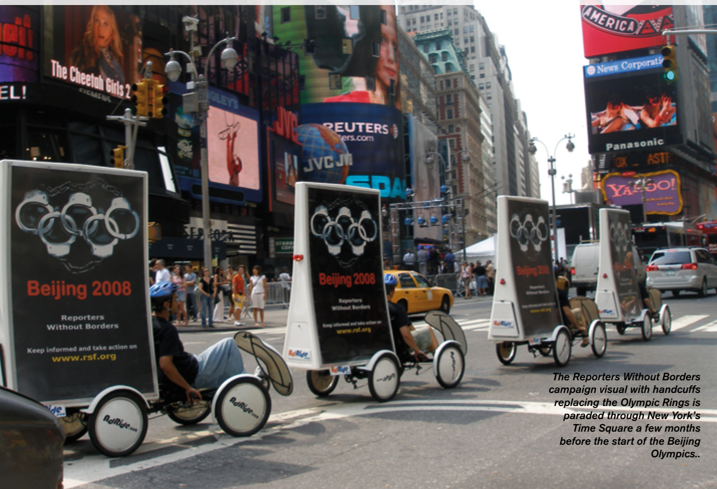
The Reporters Without Borders campaign visual with handcuffs replacing the Olympic Rings is paraded through New York's Time Square a few months before the start of the Beijing Olympics..

To combat an offensive by China's censors, we waged a gigantic international advocacy campaign throughout the three-year run-up to the 2008 Beijing Olympics that simultaneously targeted the Chinese authorities, the Olympic Committee, the United Nations and countries on the Olympic torch route. Thanks to this campaign, the entire world was told about the plight of the dozens of journalists and cyberdissidents detained in the planet's biggest prison.