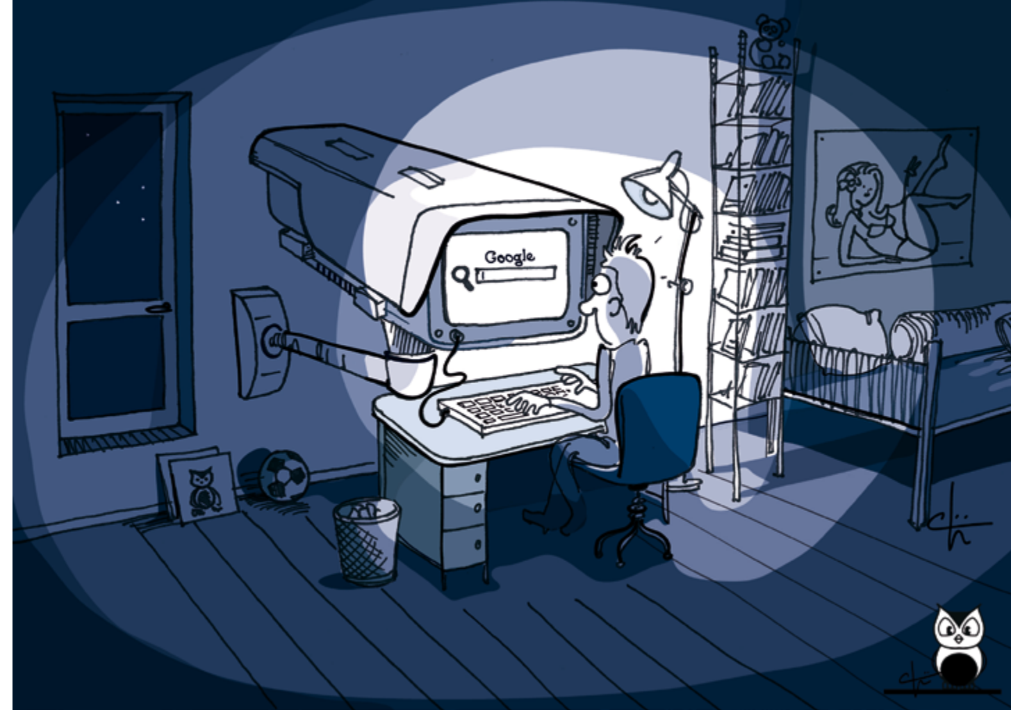
© CARTOON BY BAPTISTE CHOUËT IN STREETPRESS

In 2011, we began providing training in digital safety and distributing tools for combating online censorship and surveillance such as digital safes, VPN software and the Tor browser. The first seminar was held in Thailand and brought together journalists and bloggers from all over Southeast Asia.