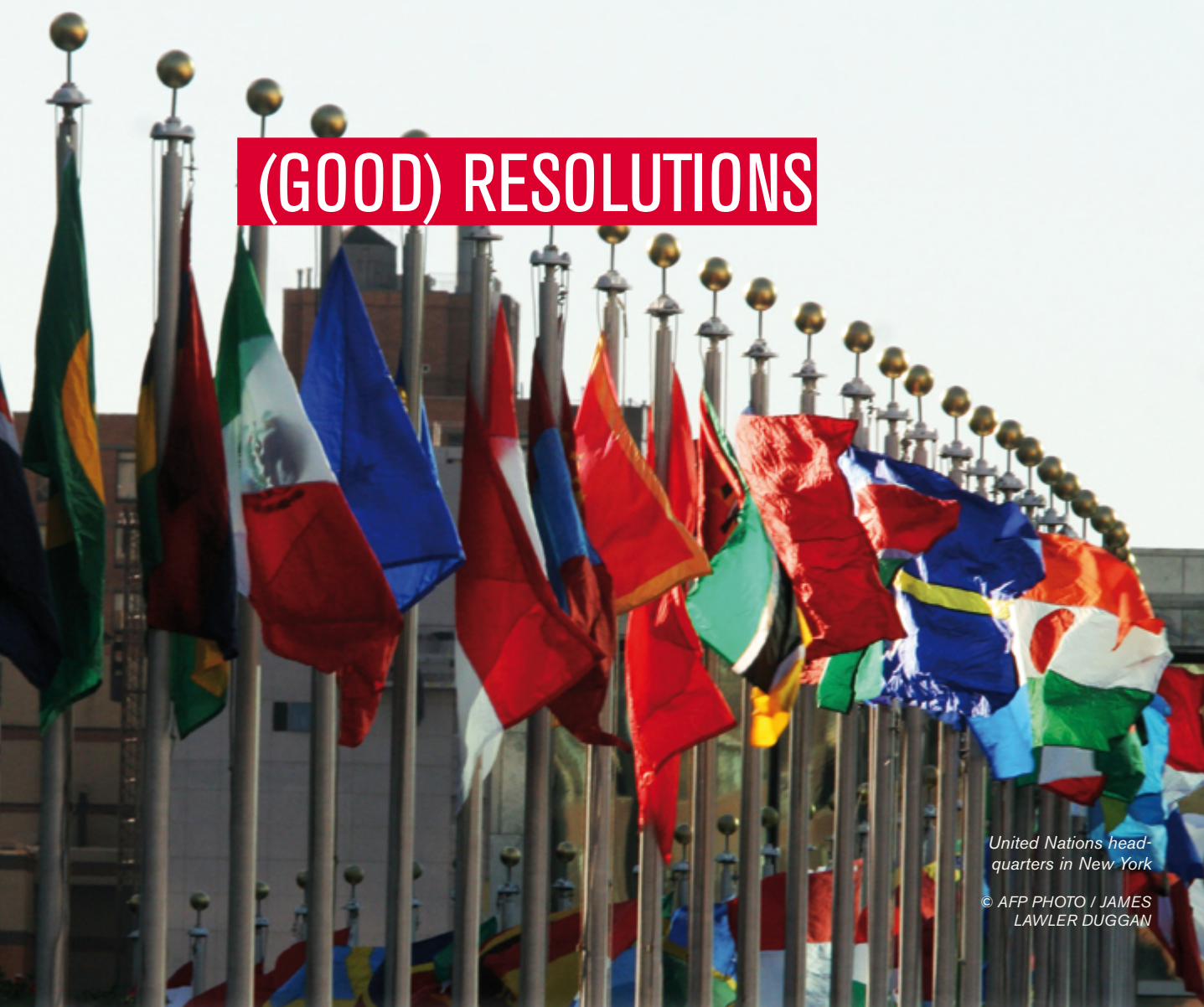
United Nations head- quarters in New York