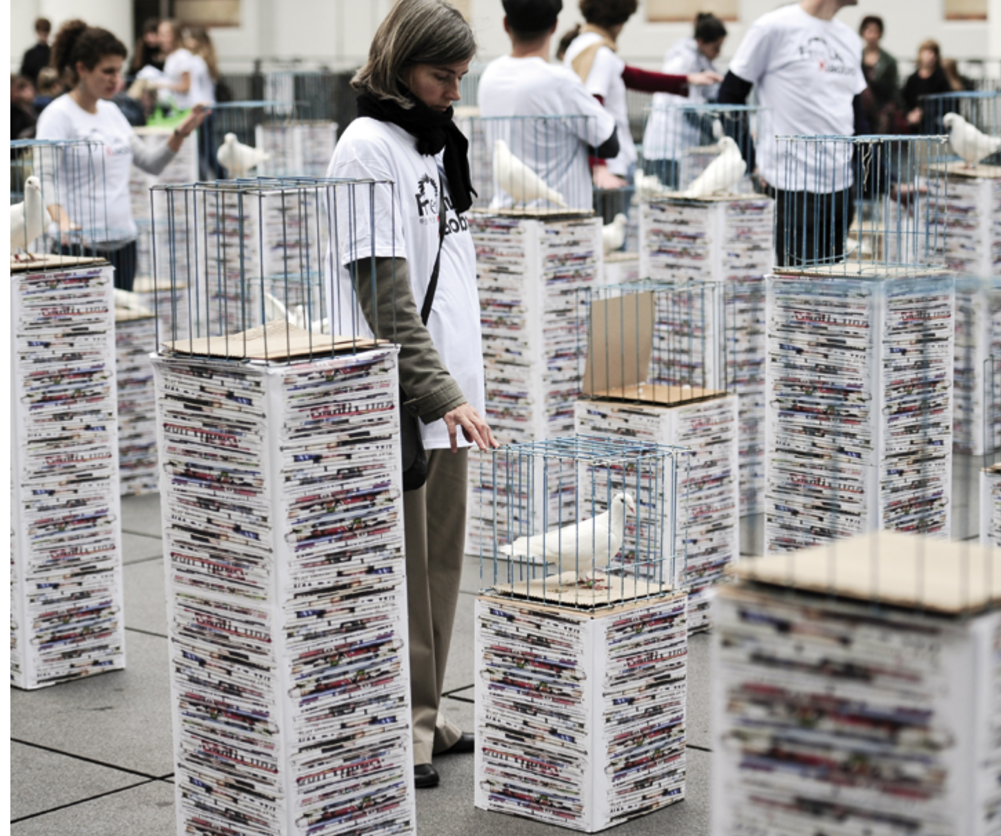
During Chinese President Hu Jintao's visit to Paris in November 2010, Reporters Without Borders releases doves in Stravinski Square in a show of support for Chinese writer and Nobel peace laureate Liu Xiaobo.

Ever since then, every 3 May provides the entire world with an opportunity to celebrate the fundamental principles of media freedom, to remind governments they should be respecting freedom of expression, to defend the independence of all media, and to pay tribute to journalists who were killed while doing their job to report the news.