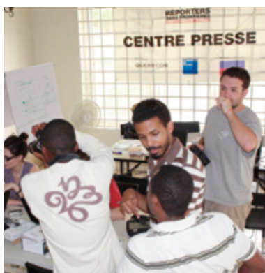
Training at the Media Operations Centre in Port-au-Prince

With the Canadian press group Québecor's help, Reporters Without Borders had a fully-equipped media operations centre running in Port-au-Prince within days of the devastating earthquake of 12 January 2010. It continued to function until the end of 2011. With 20 work-stations, it provided quake-hit journalists with the equipment they needed to keep working . A month after the earthquake, half of the capital's radio stations – the most popular source of news in Haiti – had resumed operating. Five years later, Haiti's media are back to normal.