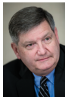
James Risen