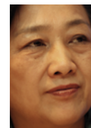
Gao Yu

A well-known journalist who has received many international awards, including the UNESCO/Guillermo Cano World Press Freedom Prize in 1997, Gao Yu has been held since 24 April 2014 for sending a copy of an internal Communist Party memo to a foreign news organization. The authorities said it was a “secret” document although it had already been posted online. Shortly after her arrest, state-owned China Central Television broadcast a video of her making a “confession.” She retracted it during her trial on 21 November, saying it was extracted under the pressure of threats against her family. A Beijing court finally sentenced her on 17 April 2015 to seven years in prison on a charge of divulging state secrets. This is the second time she has been jailed on the same charge, having been sentenced to six years in prison in 1993.