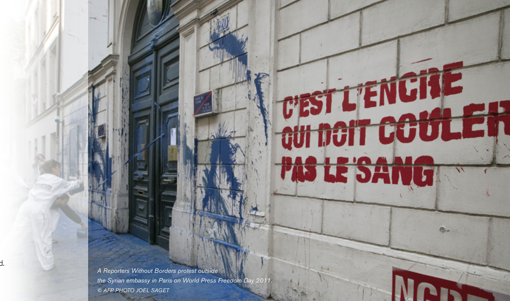
A Reporters Without Borders protest outside the Syrian embassy in Paris on World Press Freedom Day 2011.

On World Press Freedom Day in 2011, Reporters Without Borders staged a demonstration outside the Syrian embassy in Paris in protest against the Syrian government's violence against the media and detention of around ten journalists. After arriving surreptitiously in a van, our activists splashed the embassy's entrance with blue paint, symbolizing words “It is ink that should flow, not blood” alongside it in red.