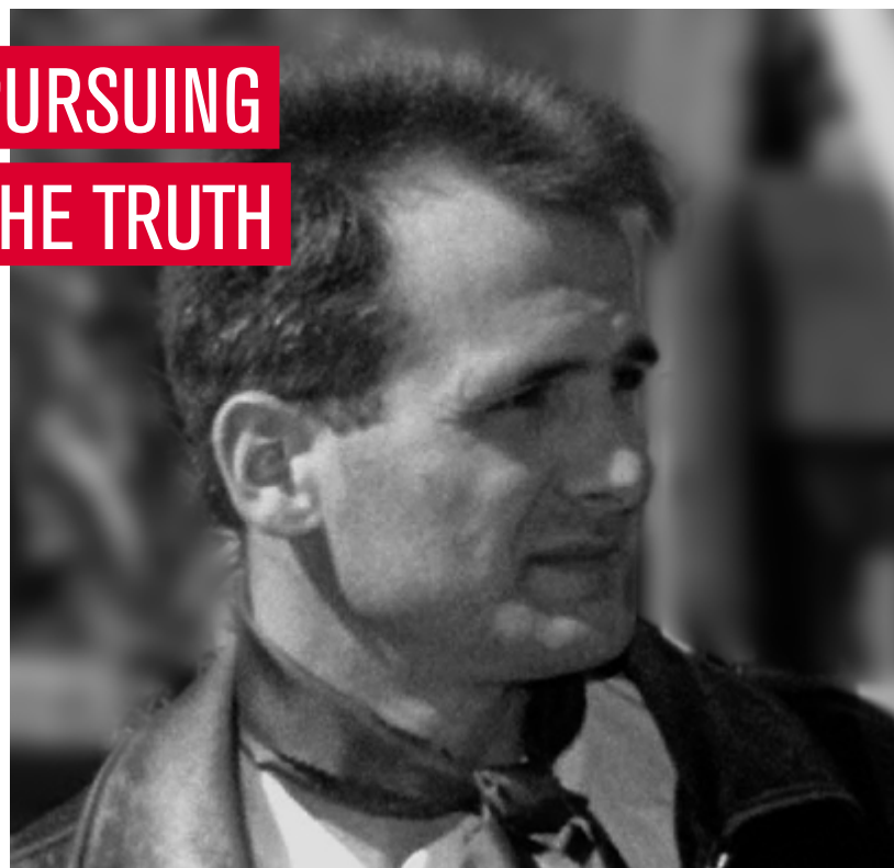
Georgiy Gongadze