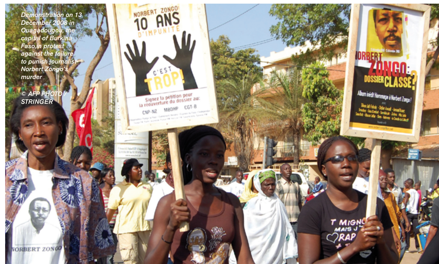
Demonstration on 13 December 2008 in Ouagadougou, the capital of Burkina Faso, in protest against the failure to punish journalist Norbert Zongo's murder