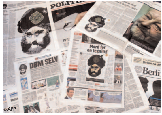
The turban cartoon is the one which prompted the fiercest reactions

wed by often violent demonstrations in almost every part of the Arab and Muslim world.