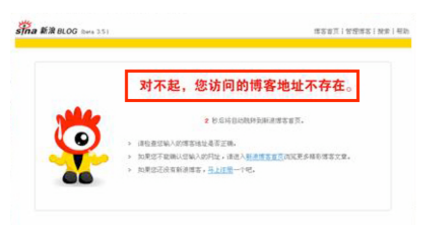
"Sorry, the blog you wish to see no longer exists"

The implementation of key-word censorship varies according to the site. Phoenix TV is based in Hong Kong but its website is registered in Beijing, which makes it subject to Chinese legislation and to supervision by the Beijing Information Office. It applies a stricter censorship than Sina and Baidu'