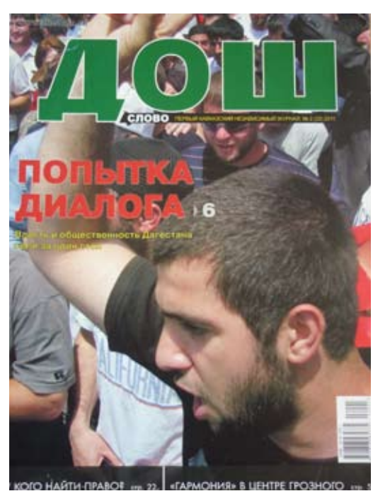
DOSH FRONT PAGE - DR

"We obviously would not tolerate newspapers that urged the population to join the boyeviki [armed separatists] and we disapprove of the ones in Moscow or abroad that romanticize their fight. But fortunately we have no such media here (...) Those who claim in the international press that the media aren't free in Chechnya are ignorant, they don't know what they are talking about. Some of them are just motivated by hatred or malice. They cannot accept the speed with which our republic has recovered from the war."