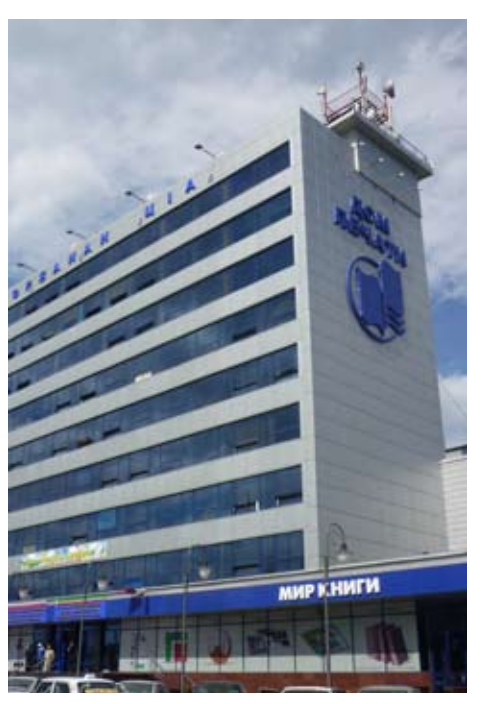
"HOUSE OF THE PRESS" IN GROZNY - DR

national and independent news websites such as Kavka-zsky Uzel (www.kavkaz-uzel.ru) are just a click away – for those that have Internet access.