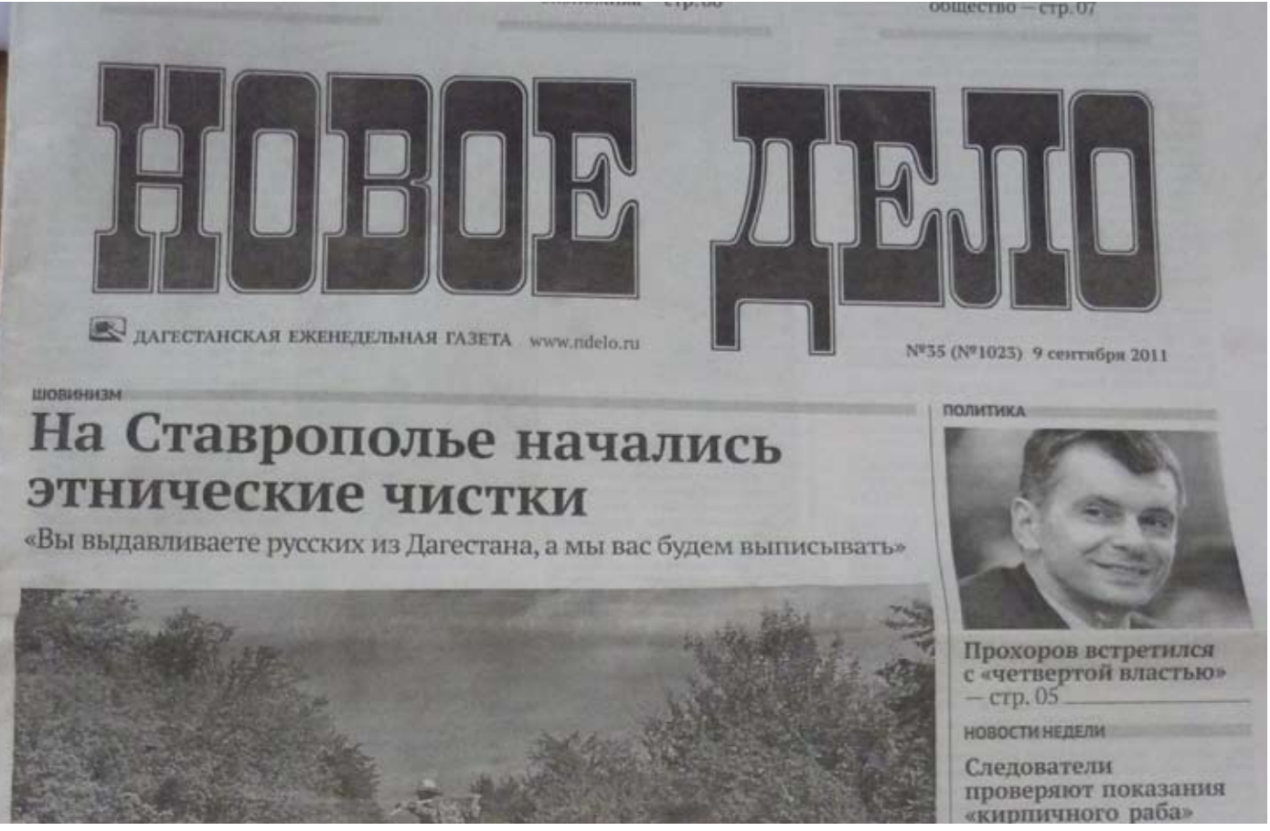
NOVOYE DELO FRONT PAGE