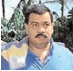
Diego Fernando Murillo Bejarano