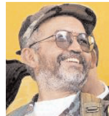
Raúl Reyes, FARC

Uribe gave himself a year to crush the FARC guerrillas when he became president in 2002, but the FARC military structure remained intact and only one of their chiefs, Simon Trinidad, was captured and extradited because of his drug-