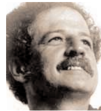
Luis Carlos Galán

Two local journalists were killed in the course of a bloody crackdown at the end of the 1980s on members of the political opposition suspected